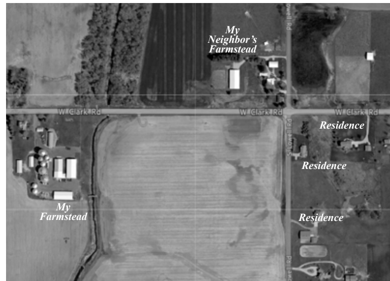
Sample Neighborhood Map